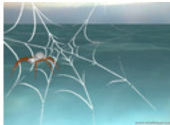
World Wide Web

The Apache Group develops the Apache web server and server-side Java , and XML projects. Heritrix is the web crawler used by the Internet Archive .